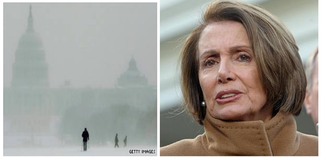
A winter storm is expected to wallop the D.C. area Saturday.\ SO THIS IS HOW THEY BRIBE THE VOTES FOR THEIR COMMUNIST AGENDA